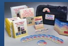
Visual Workplace Video Training System (Spanish sub-titles)