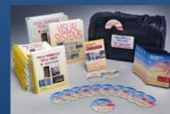
Visual Workplace Video Training System (Spanish sub-titles)