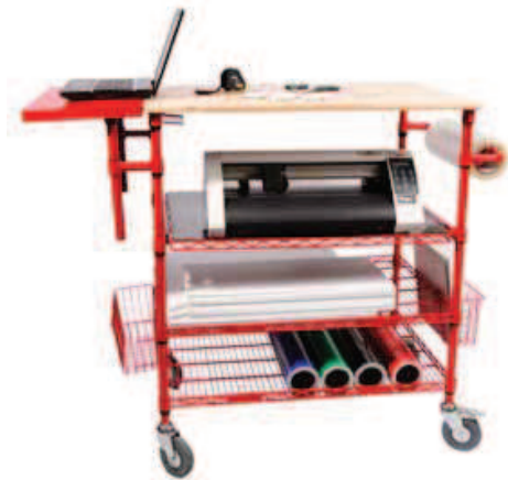
Mobile In-House Sign Shop

Sign hanging tools are an ideal complement to the company's Mobile In-House Sign Shop (MIHSS), which gives users the ability to quickly and easily make their own professional signs, banners and other visuals at a fraction of the cost of purchasing them from an outside vendor, and without the wait. The Mobile In-House Sign Shop is an extremely cost effective solution for companies active in, or getting started with, 5S, Lean implementation and continuous improvement throughout the workplace.