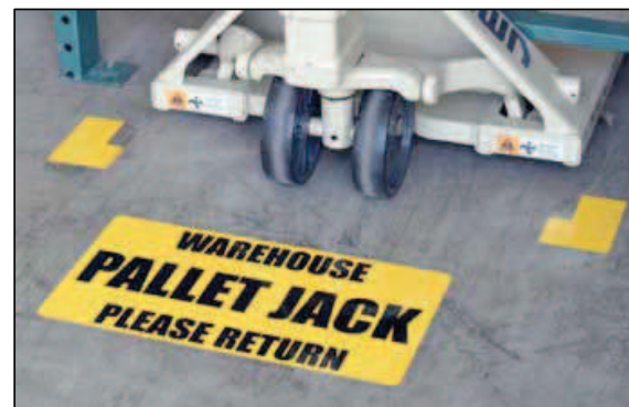
Vinyl Floor Graphics