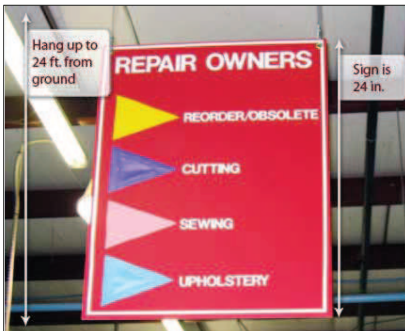
Figure11. The sign above is 24 inches tall and should be hung up to 24 feet from the ground to achieve the best visibility.