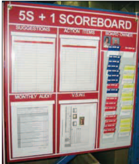
Grommets and zip ties