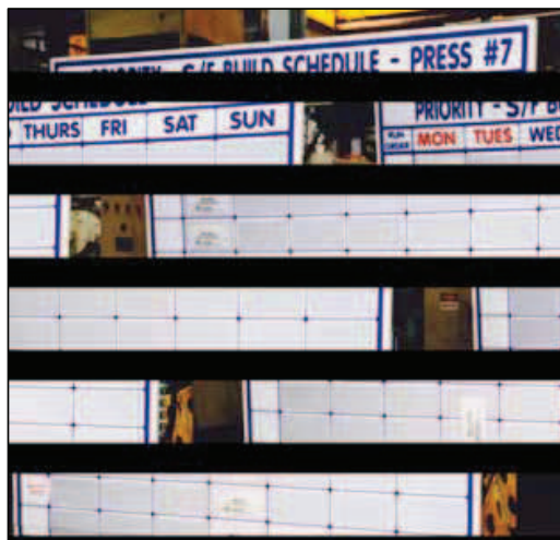
3mm PVC Signboard