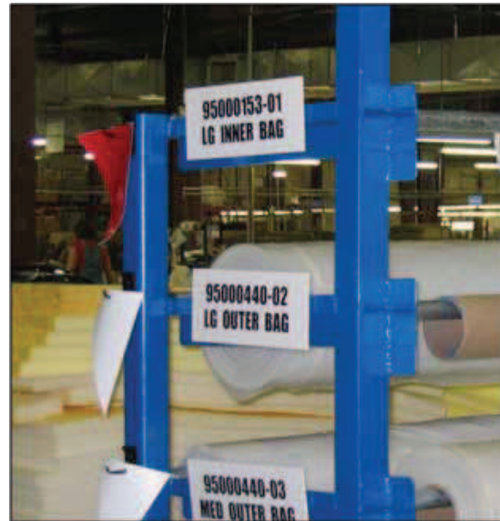
Hoop and loop fasteners