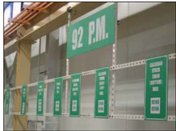
Signs can be hung at pre-determined heights to control how high inventory and materials can be stacked.