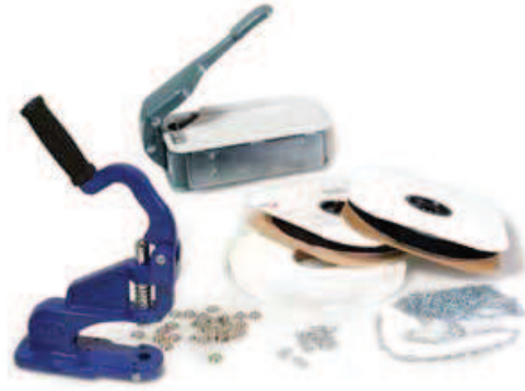
Visual Workplace, Inc. offers commercial-grade sign hanging tools.

Visual Workplace offers a complete family of Sign Hanging Tools . These commercial-grade solutions help users to easily and professionally mount and hang signs and banners that will stand the test of time. Available tools include a professional grommet press, heavy duty grommets and washers, safety rulers, corner cutters, Velcro and other fasteners, chain link, S-hooks, mounting tape, adhesive and magnetic clamps, U-clips and hanging tabs.