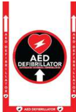
60-1009-2436-FA713 Floor Kit