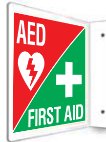
60-1936-0808-FA245 8" x 8" Panel 90°