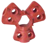
Pneumatic Quick-Disconnect Lockout 57-2579-3030-623