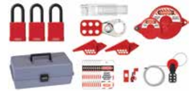
Valve Lockout Kit 57-2534