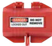
Power Plug Lockout, 220-550V 57-2573-7045-220V