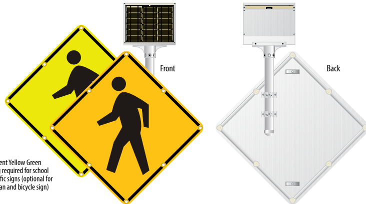
Fluorescent Yellow Green sheeting required for school area traffic signs (optional for pedestrian and bicycle sign)